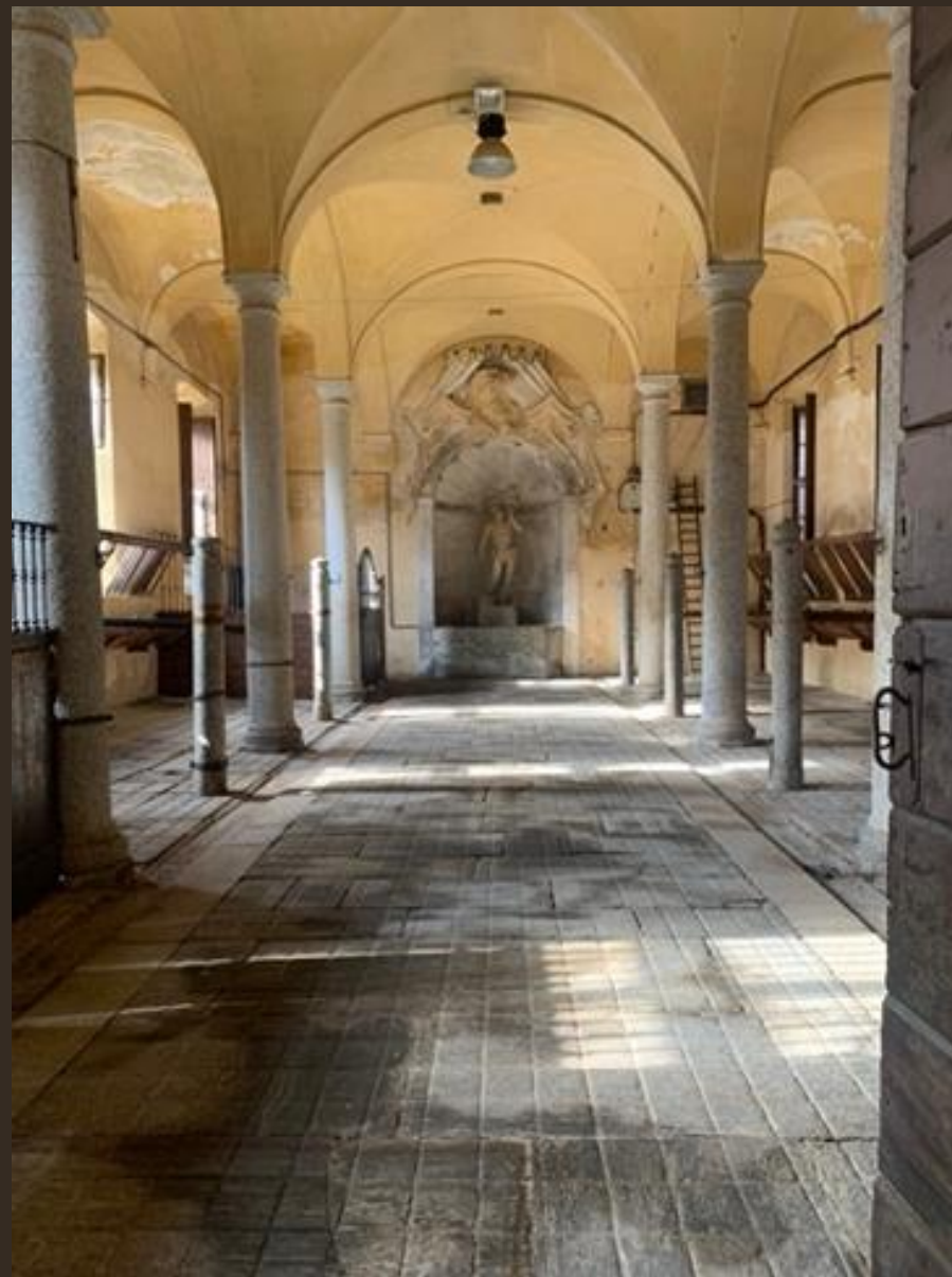
Scuderia Villa Arconati