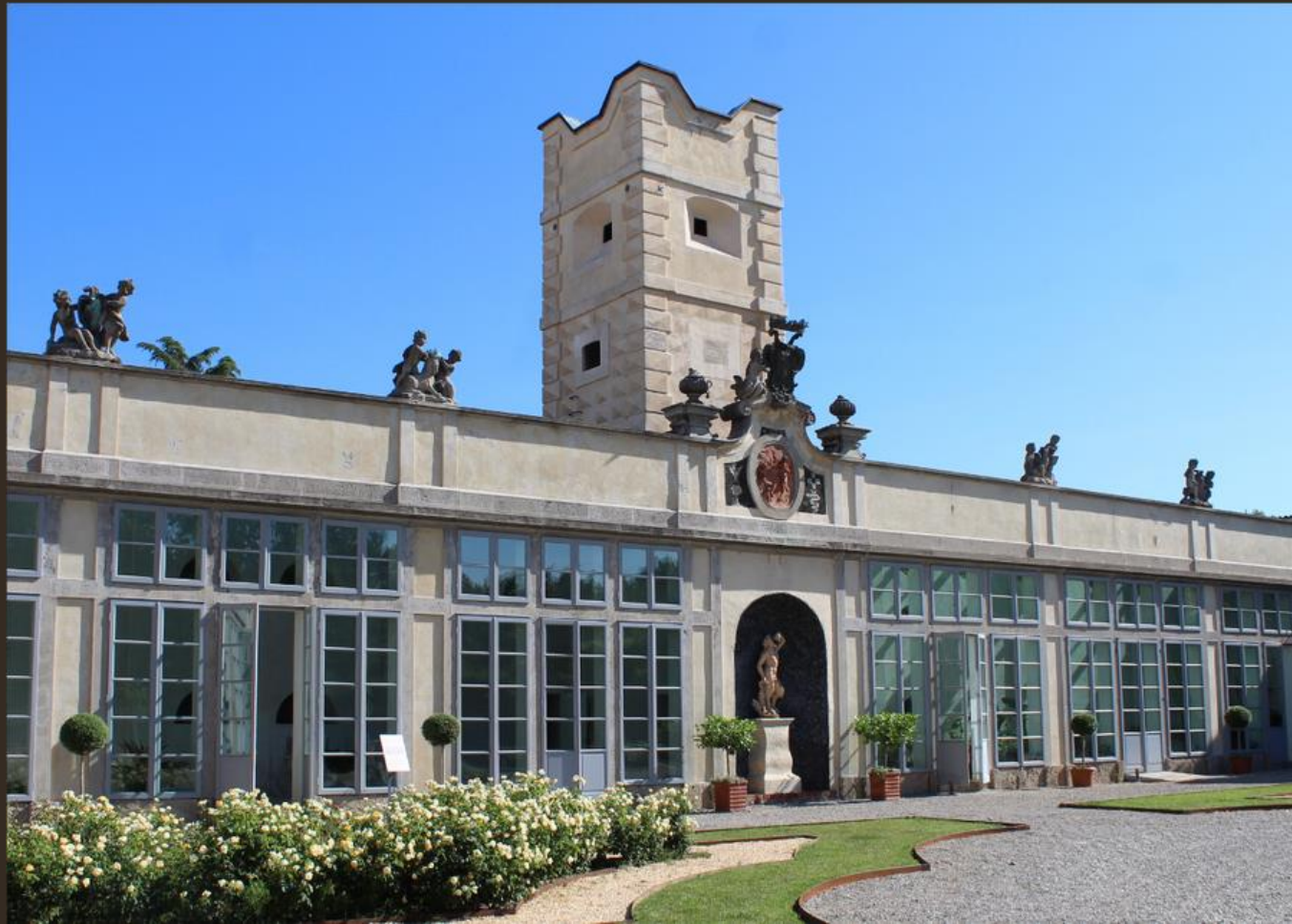
Orangerie Villa Arconati